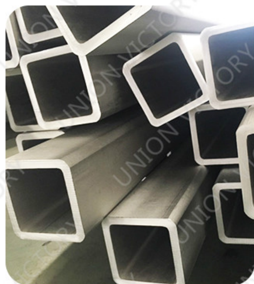
Square & Rectangular tubes