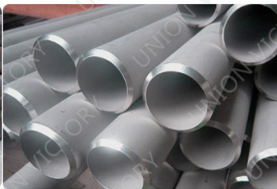
Stainless Steel Pipes/Tubes