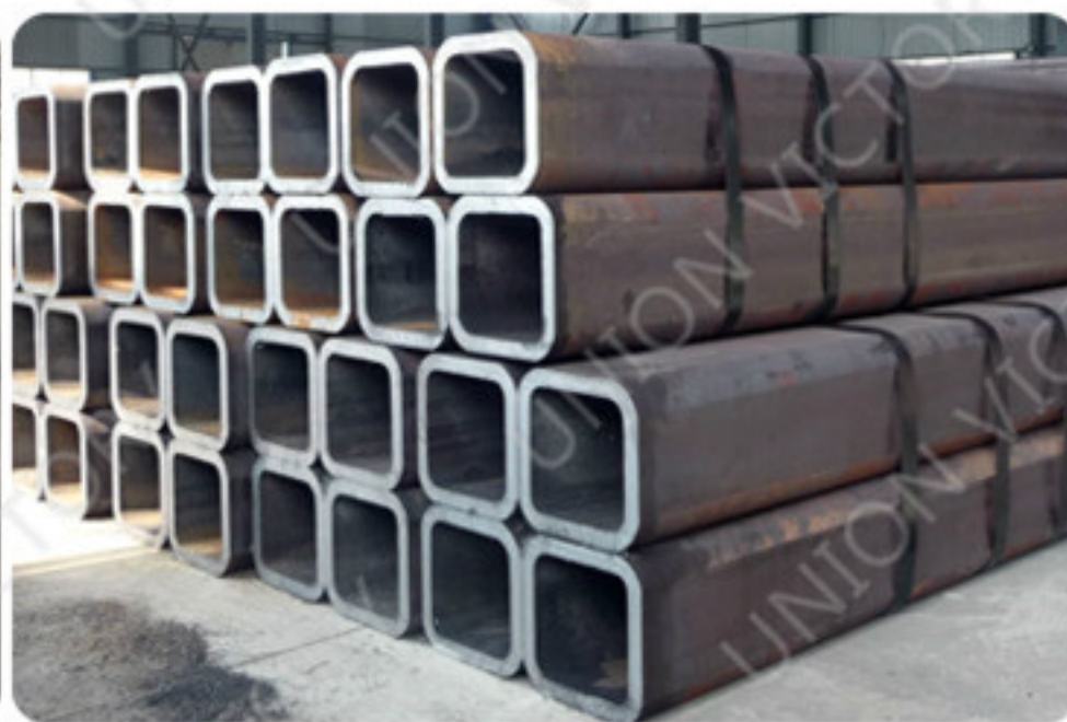
Rectangular & Square Pipes